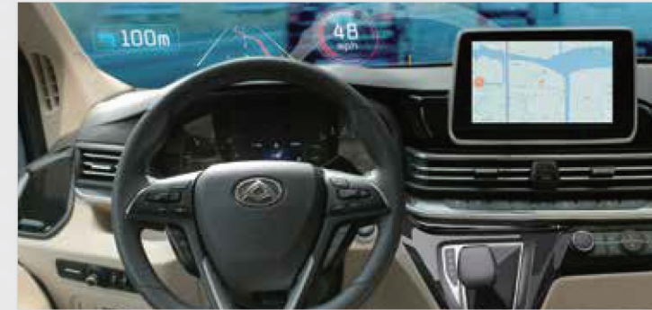
More Hi-Tech, Efficient and Safer