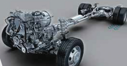
High Payload, More Loading Rear-drive Dual Tires Optional; Maximum Load 2T