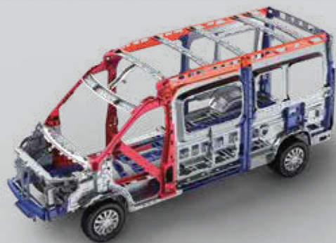
Top Safety Full Body Structure