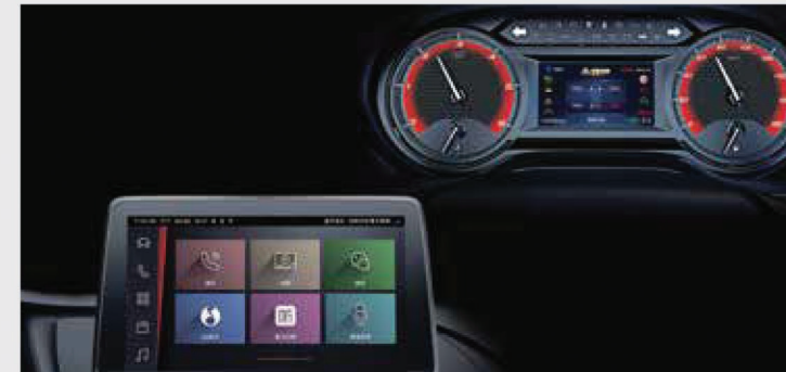
10.1-inch HD Smart Touch Screen + 4.2-inch LCD Instrument