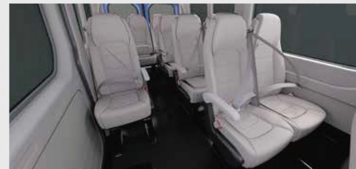
More Comfortable, Enjoy Prosperity Comfortable seats with rear air conditioning units for passengers