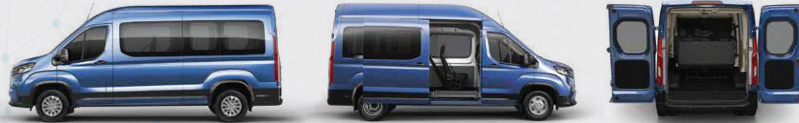
Single sliding door