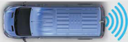
Rear Overhead Camera + Reverse Image