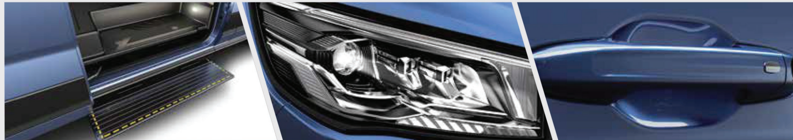
More Convenient, Deluxe Drive